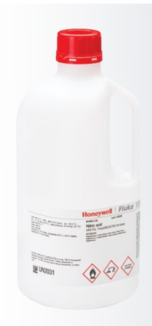
Honeywell Fluka -Nitric Acid TraceSELECT

The reduction of metals into mercury is more favourable than reduction to the solid-state electrode. Further on there is always a clean new Hg electrode surface available for each measurement.