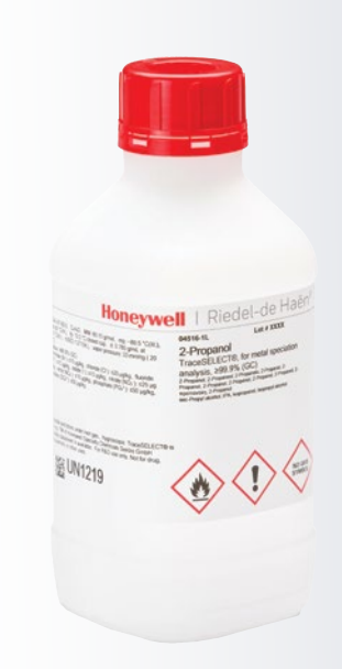
Honeywell Riedel de Haën -2-Propanol TraceSELECT 04516-1L

The elemental response is usually independent of species, so it is often possible to quantify a species even when its structure is unknown (assuming good HPLC recovery). Identification, however, is based solely on retention time matching. Therefore, a compound in the sample can be identified only by comparison with a standard.