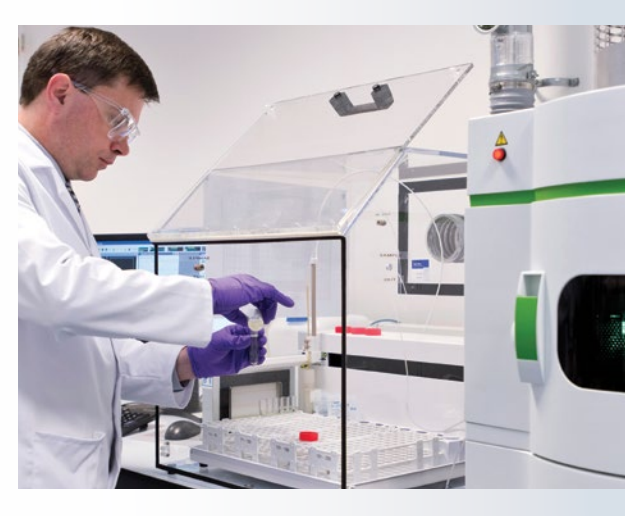
Atomic Emission Spectroscopy Analysis

With Honeywell's analytical reagents, superior quality and safety standards are a prime focus. We use a comprehensive Quality Assurance System in line with EN 29001 (ISO 9001) and each of our products is manufactured to clear, guaranteed specifications. We employ a large variety of modern analytical methods, such as inductively coupled plasma optical emission spectroscopy (ICP-OES), inductively coupled plasma mass spectrometry (ICP-MS), flame atomic absorption spectroscopy (AAS) and graphite furnace AAS (GF-AAS). This allows for specifically tailored control and analysis procedures for each product.